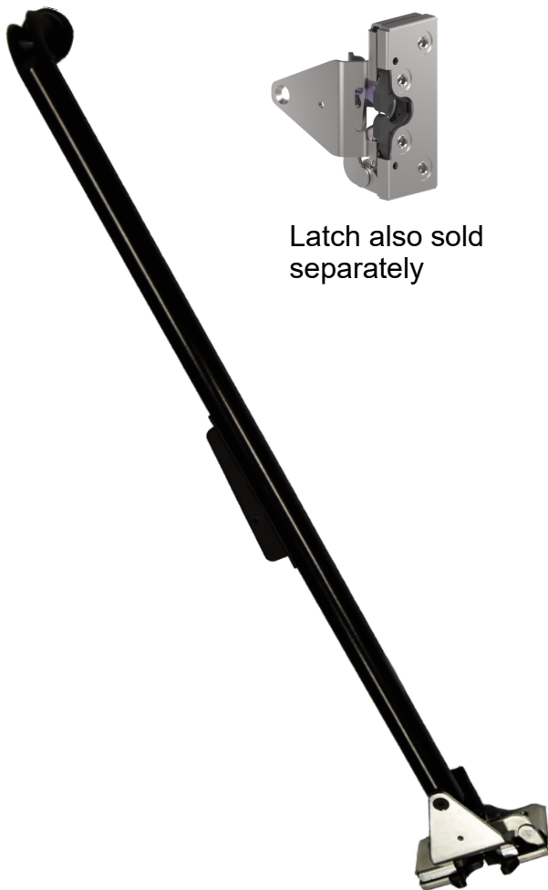
Latch also sold separately